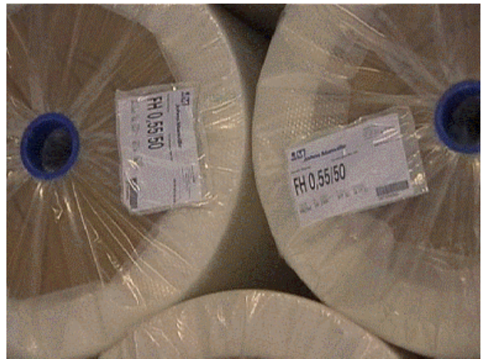
Each part has its own barcode ID

Consumption quantities, qualities, times, changes of storage location, inward/outward goods movement from proprietary and external procurement automatic allocations – but also additional specifications which can be entered via dialogs – are integrated in the plant data collection (BDE) function of OSCo!