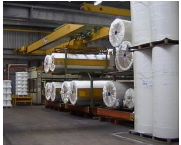
Only perfect goods are stored in the warehouse

Business partners and field staff are also integrated smoothly via Internet technology (including the SAP New Dimension products). The planning and availability of resources between locations and systems are also ensured. All events, figures and analysis are presented quickly and clearly on ergonomically designed, particularly user friendly front-end tools.